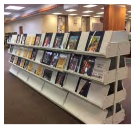
Current Magazine Shelving