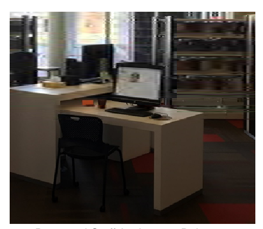
Proposed Staff Assistance Point