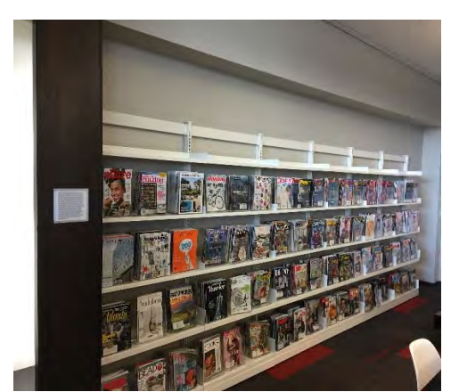
Proposed Magazine Wall Mount