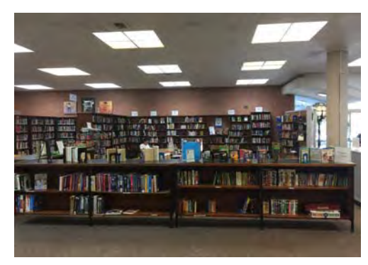
Current Friends of the Library Sale Area