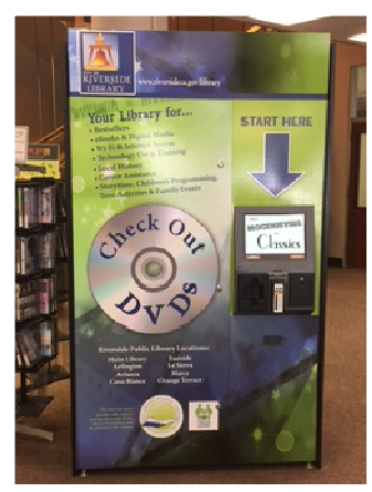
Proposed 750-Capacity DVD Unit