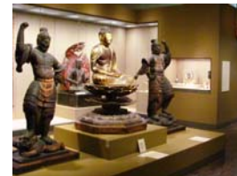
Asian Art Museum San Francisco