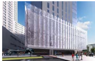
Mexican Museum San Francisco