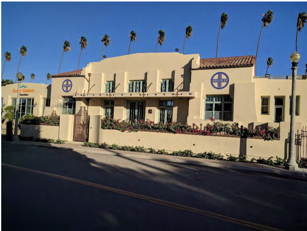
Enclosure wall, view looking east