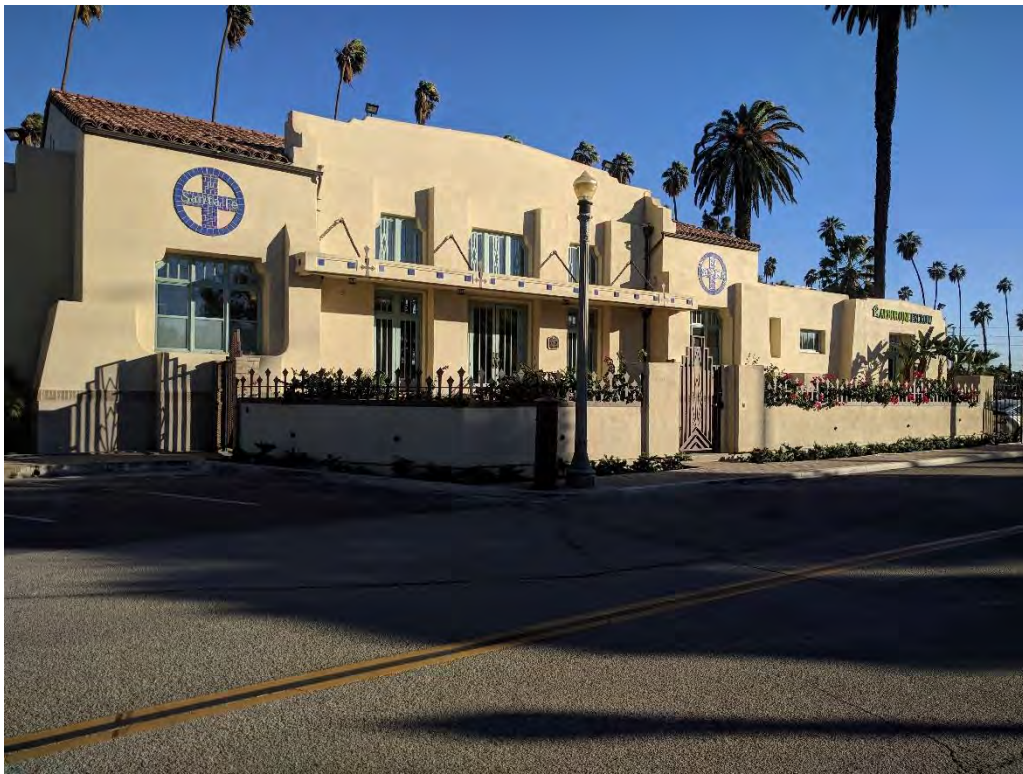
Enclosure wall, view looking southeast