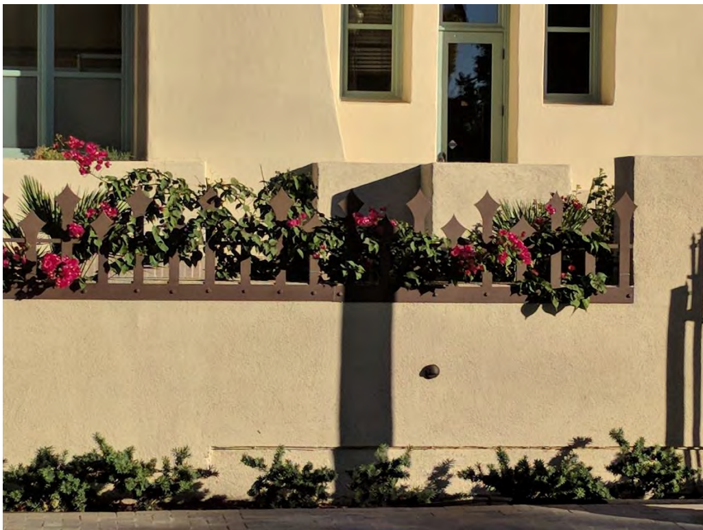
Balustrade with landscaping