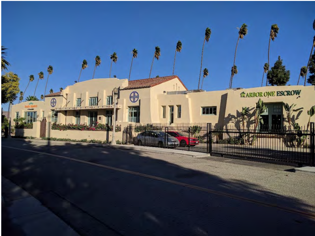
Santa Fe Depot