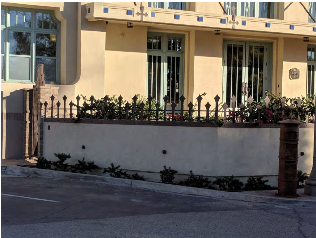
North elevation of wall with gate and balustrade