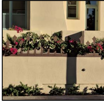
Wall and metal balustrade