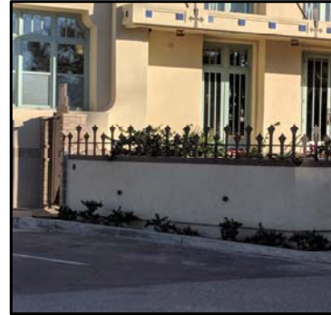
North gate & wall