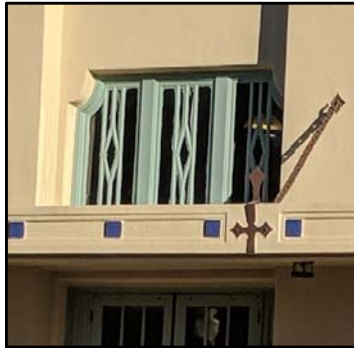
Clerestory and canopy