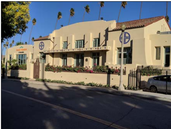
View looking northeast