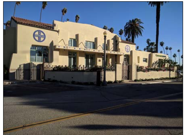
View looking northwest