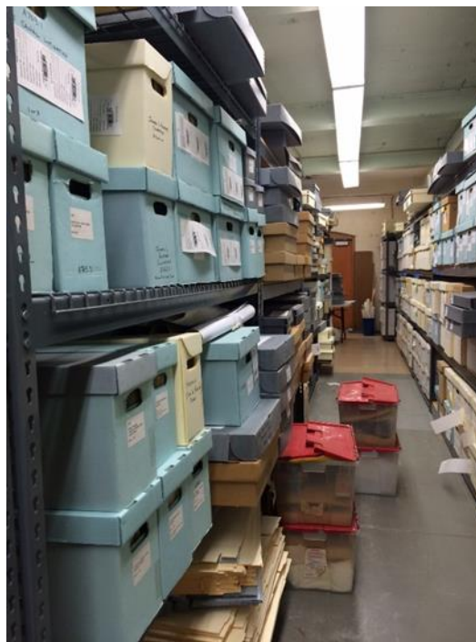
Archives that were in Museum basement