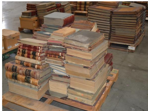
Images of City Clerk's Archive Material