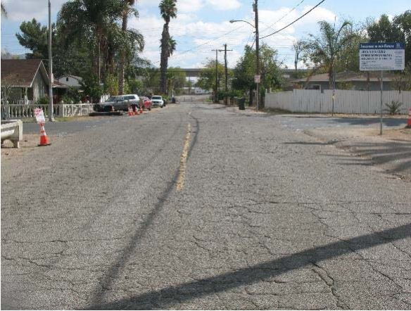
PROVIDE SIDEWALK AND PEDESTRIAN RAMPS