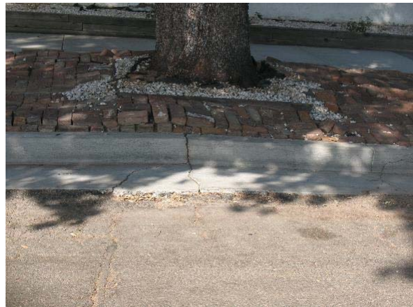
CURB AND GUTTER REPAIR