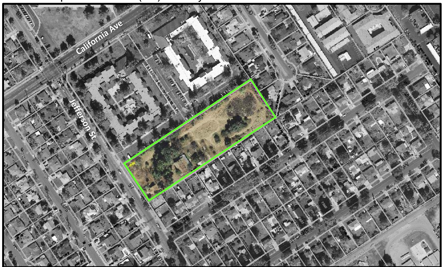
Exhibit 'A' - Planning Case P17-0838 - Zoning Map Amendment Removal of Airport Protection (AP) Overlay Zone