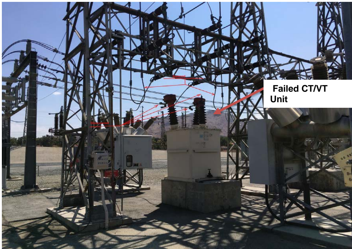
69KV Metering PT – SCE Vista Substation

The estimated costs and schedule for the Vista Work is provided by SCE in the table below. The target completion date for this project is October 2018.