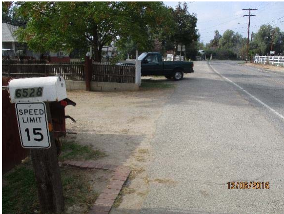
REPLACEMENT OF POLES