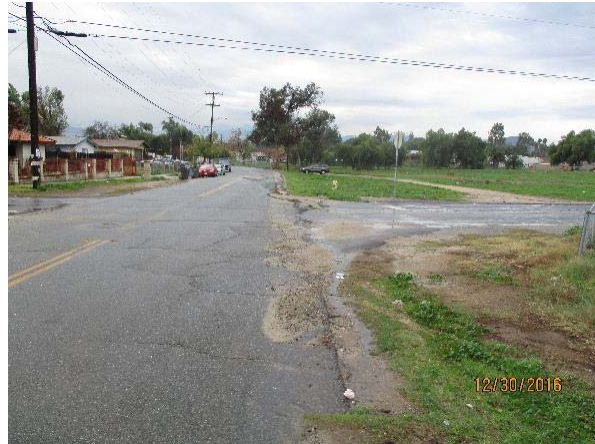
RESOLVE DRAINAGE ISSUES