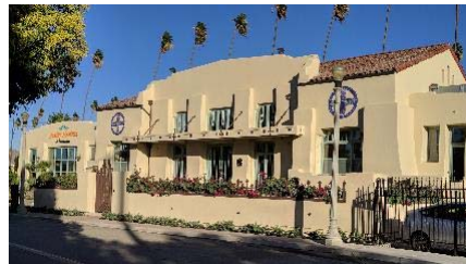
Santa Fe Depot