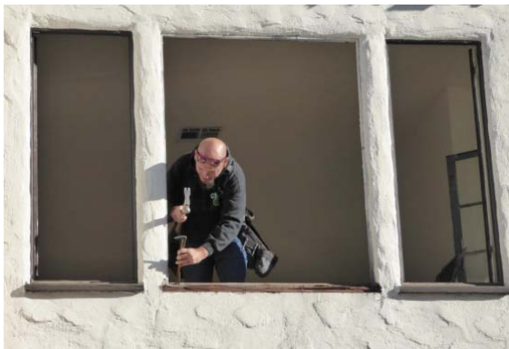
Historic Preservation Fund