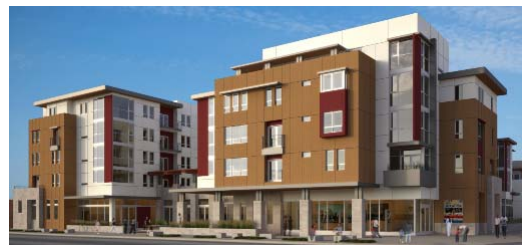
Mission Heritage Plaza