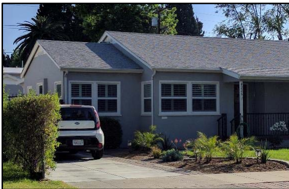
Appropriate Vinyl Windows