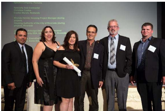
Camp Anza at CPF Awards