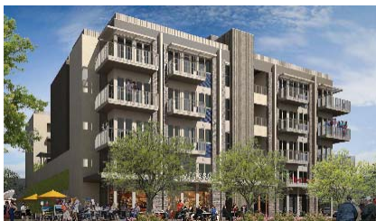
Main and 9th