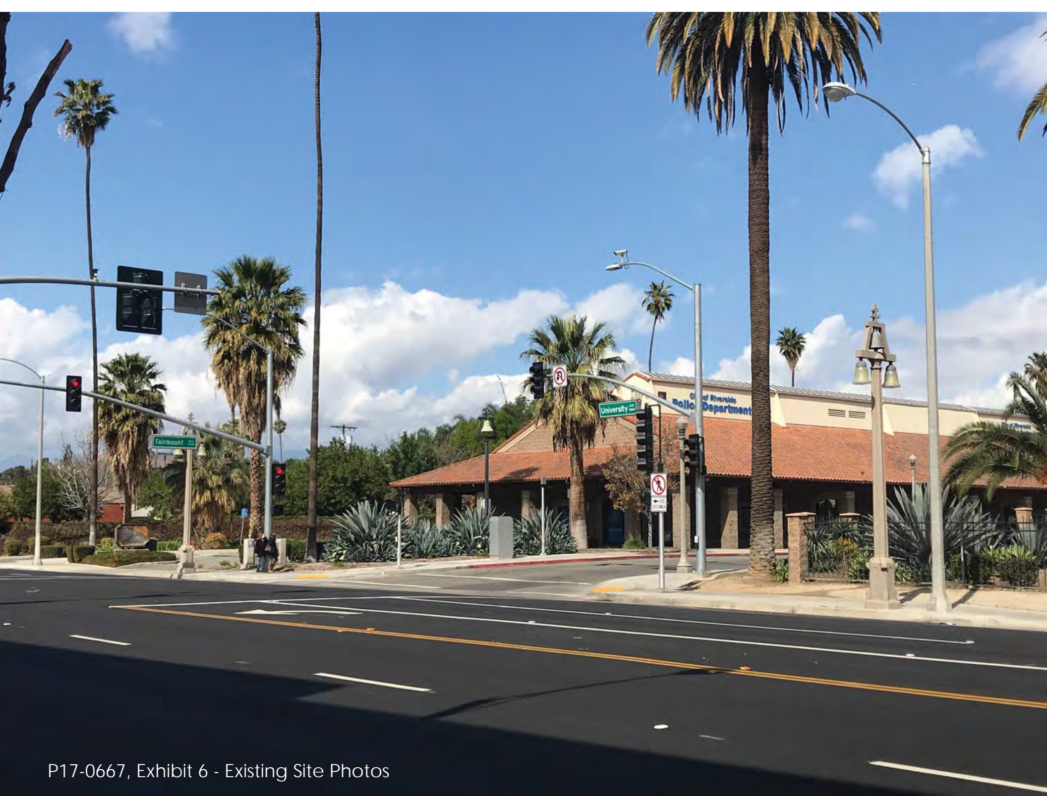
P17-0667, Exhibit 6 - Existing Site Photos