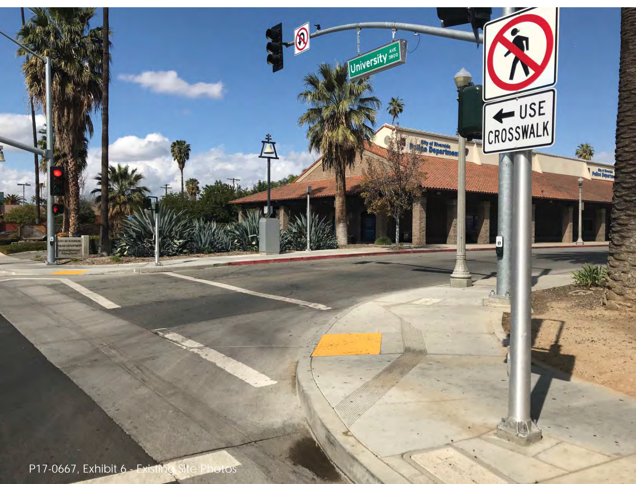
P17-0667, Exhibit 6 - Existing Site Photos