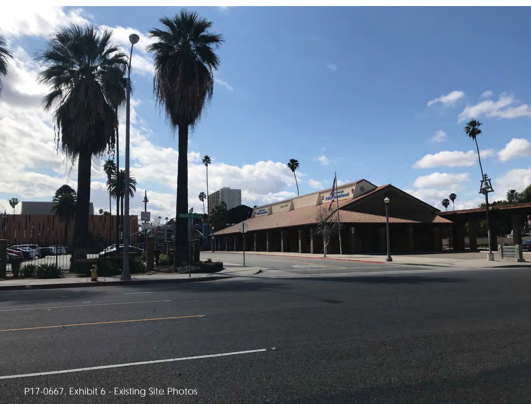
P17-0667, Exhibit 6 - Existing Site Photos