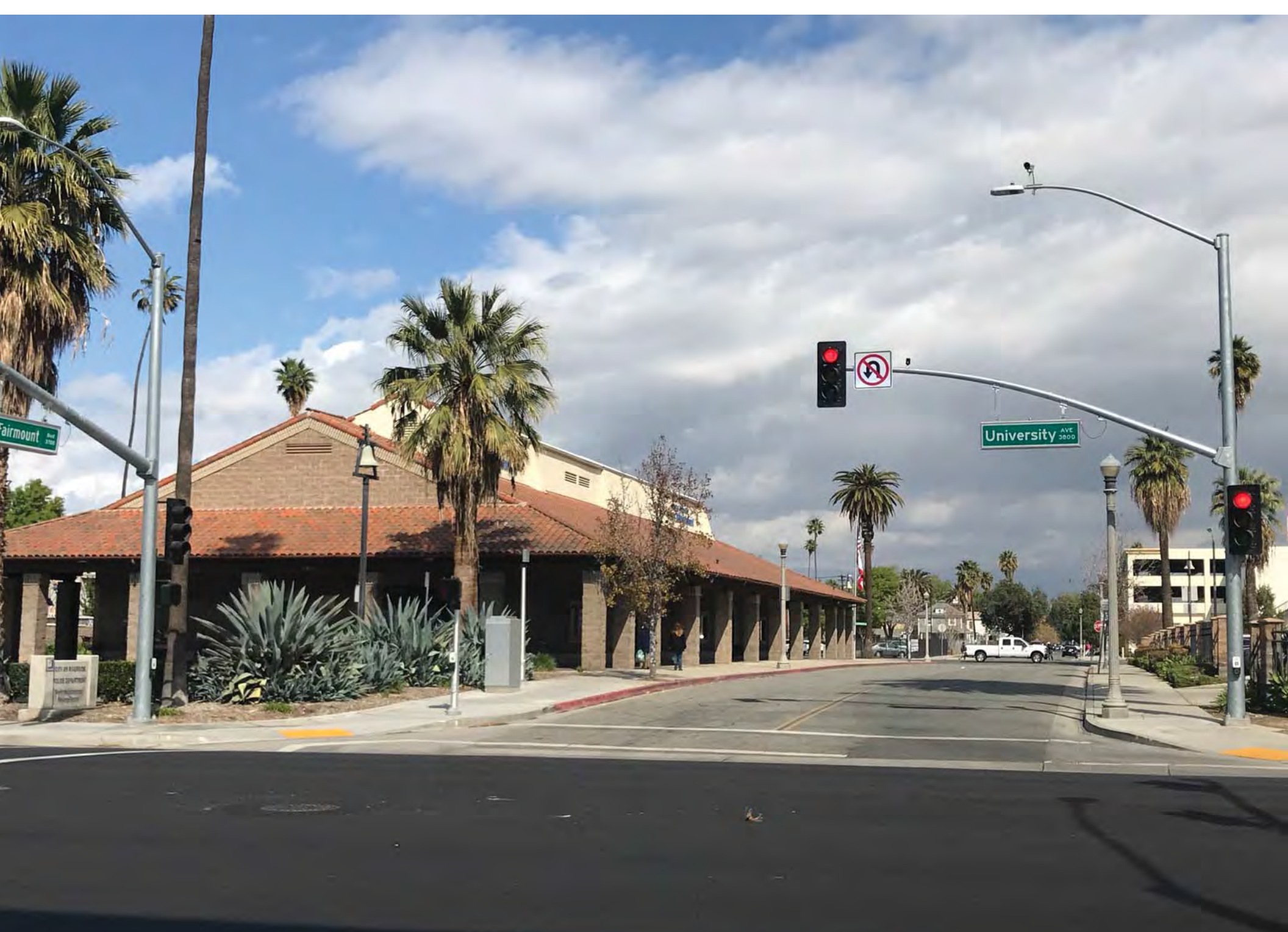
P17-0667, Exhibit 6 - Existing Site Photos