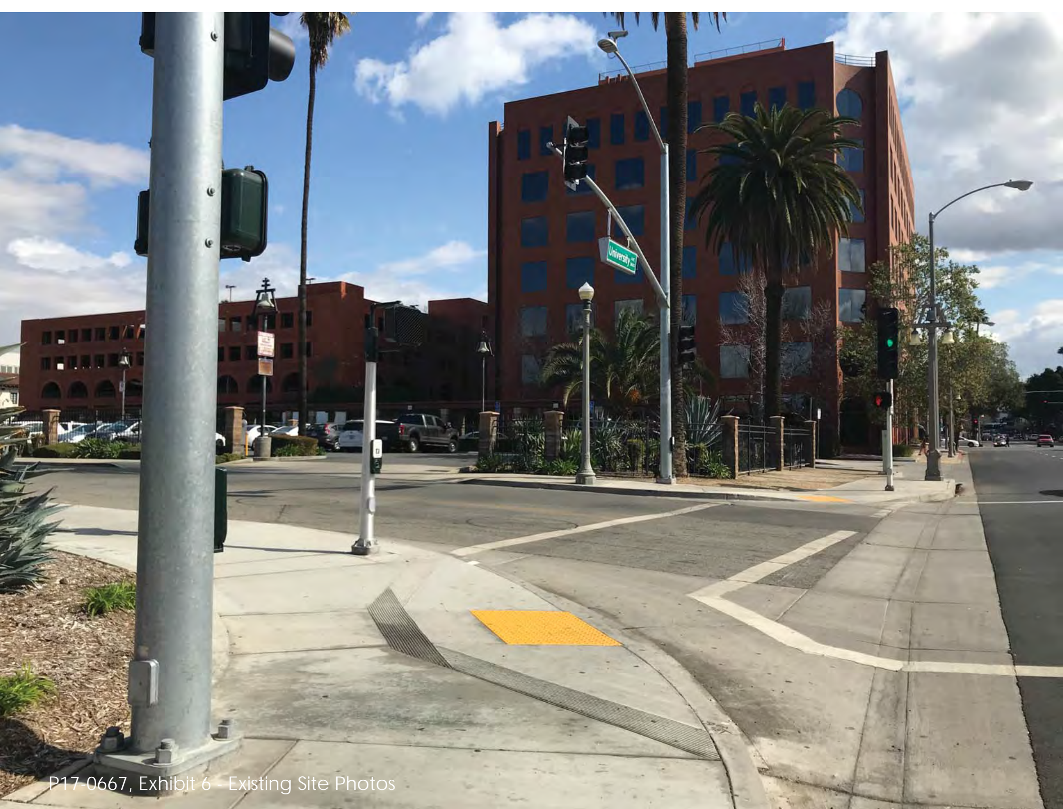
P17-0667, Exhibit 6 - Existing Site Photos