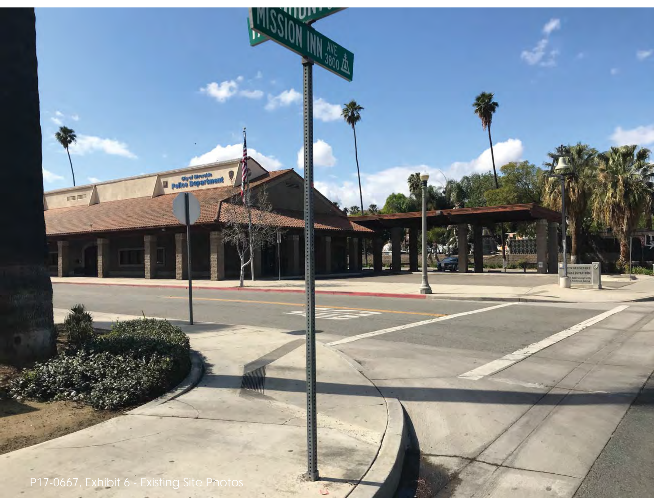
P17-0667, Exhibit 6 - Existing Site Photos