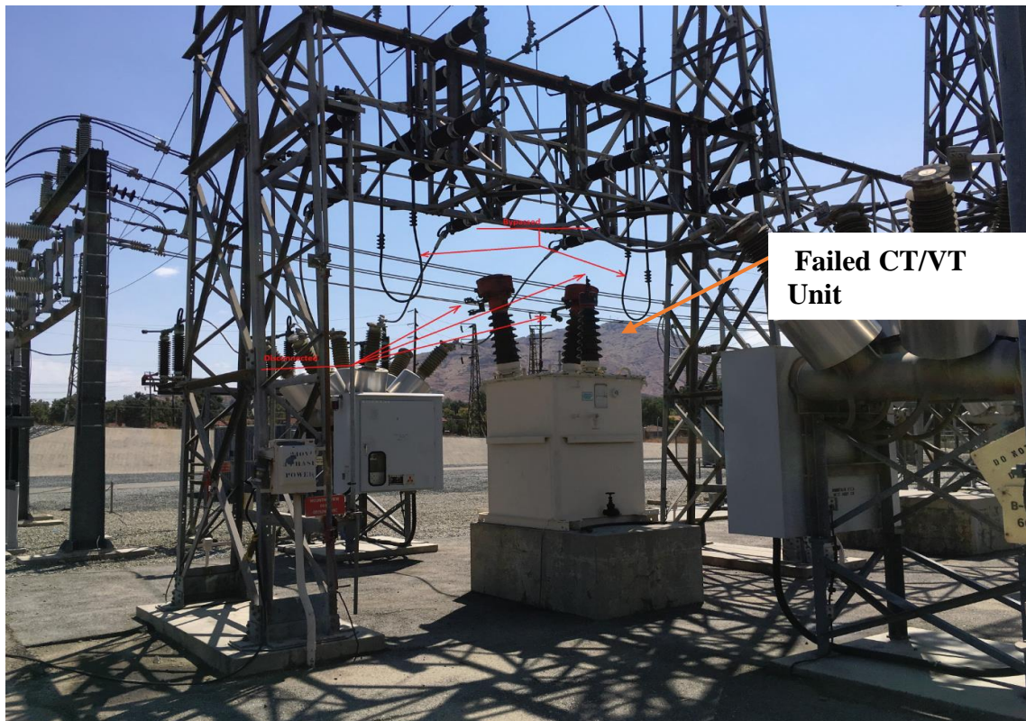
69KV Metering PT – SCE Vista Substation

The estimated costs and schedule for the Vista Work is provided by SCE in the table below. The target completion date for this project is October 2018.