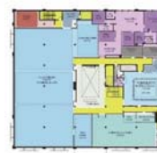
Upper Level 14