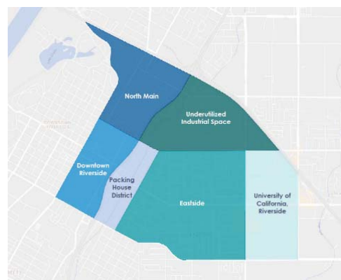
INNOVATION DISTRICT FOOTPRINT