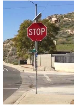
NEW EDGE-LIT STOP SIGN AT CALIFORNIA & BOLTON