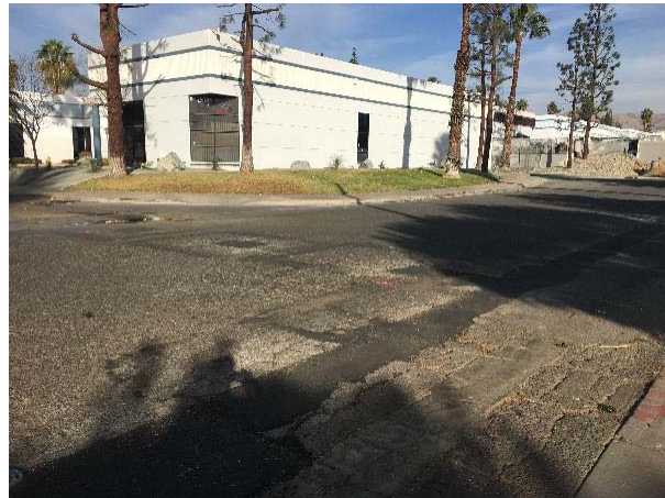
7 TH STREET & PRESLEY AVENUE