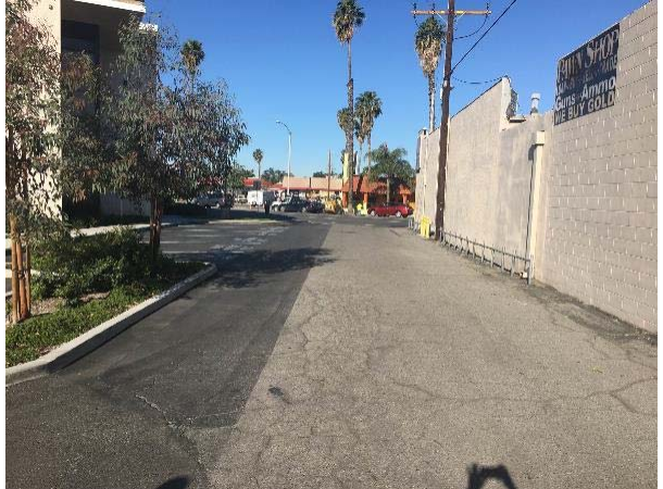
MAGNOLIA/DE ANZA ALLEY (WARD 3)