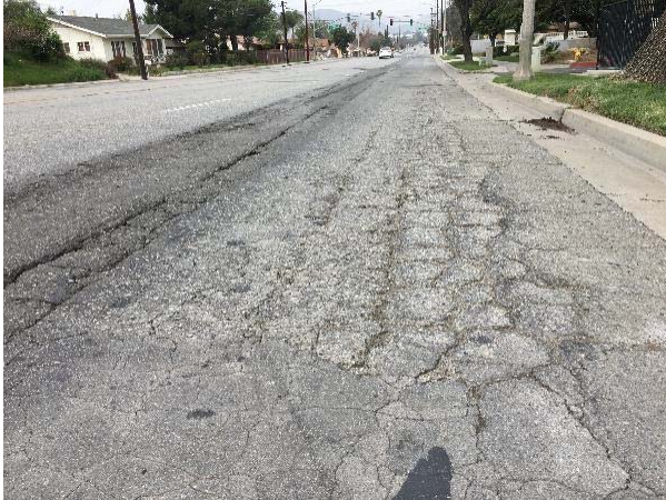
COLUMBIA AVENUE (WARD 1)