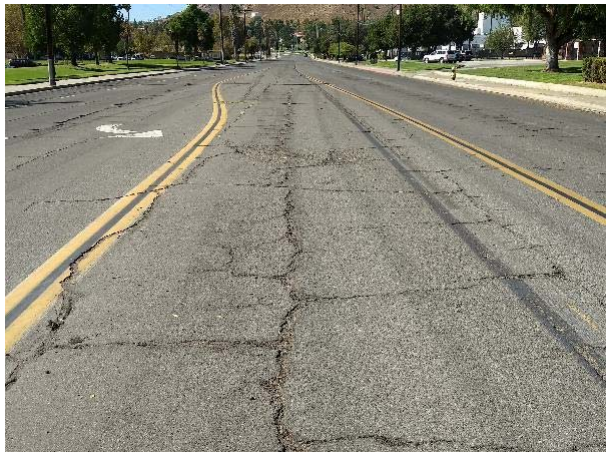
PIERCE STREET (WARD 7)