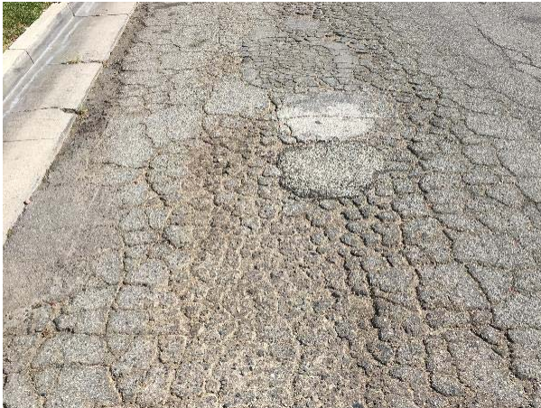
SKOFSTAD STREET (WARD 6)