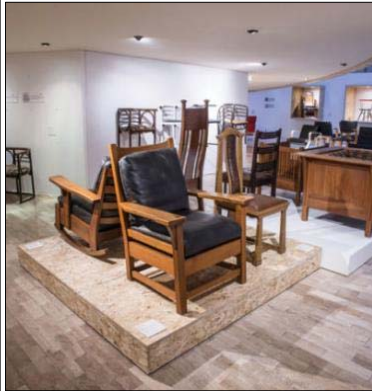
Evolution of Chairs Exhibit