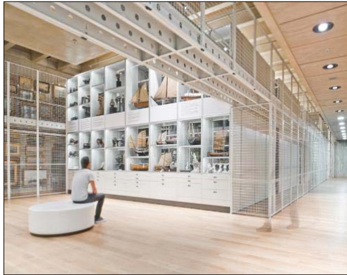
Museum Storage and Exhibition