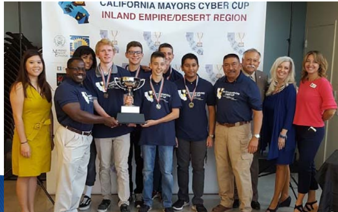
Martin Luther King High School