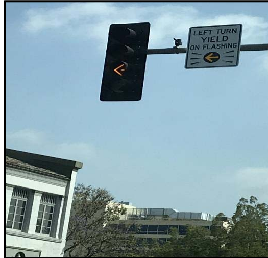
PHOTO OF PILOT PROJECT IMPROVEMENTS