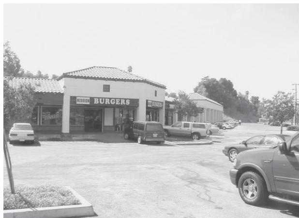
The Pine Center Shopping Complex

Presently, most residents in Downtown and vicinity travel to Magnolia Center, the University Community, or Canyon Crest to satisfy their daily shopping needs. This is an anomaly that begs to be addressed by convenient, attractive, secure, and appropriately stocked stores in the immediate Downtown area. In designating these existing centers as Neighborhood Commercial Districts, it is the intent of this plan that the City would partner with the private sector to revitalize these centers and help them realize their full potential to serve the daily shopping needs of the Downtown as well as the Northside and parts of the Eastside neighborhoods.