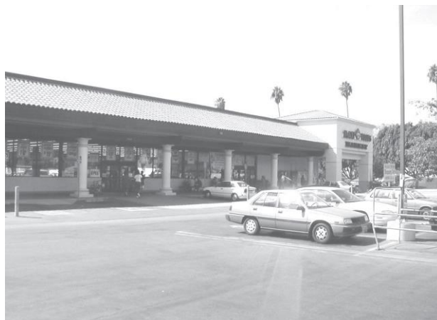
The Shopping Complex at Brockton and University Avenues