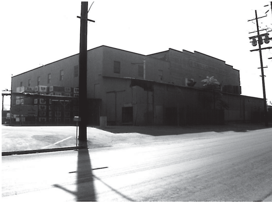
Historic Photo, unknown date