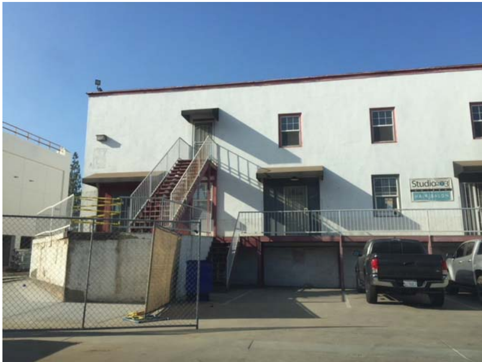
Two-story administration addition, view looking south