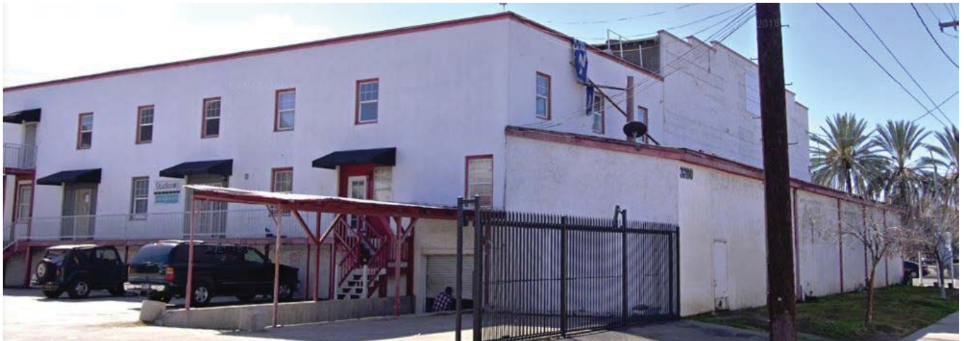
North and west elevations, view looking southeast