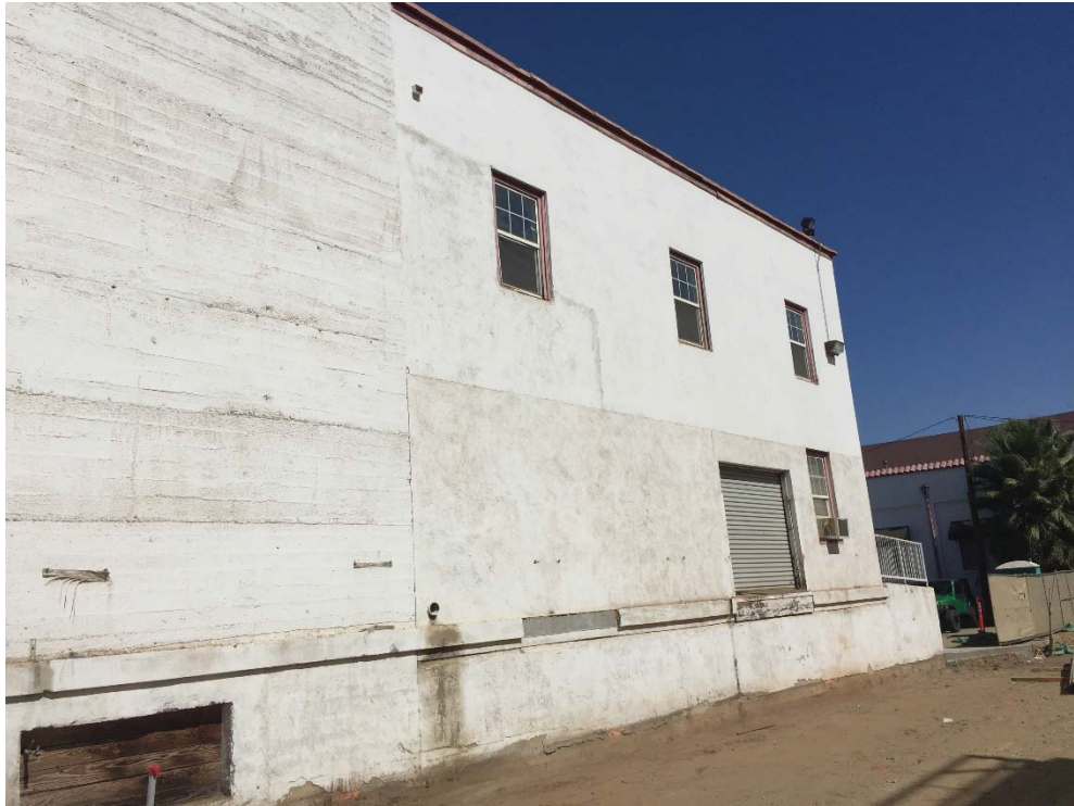
East elevation loading bay, view looking northwest