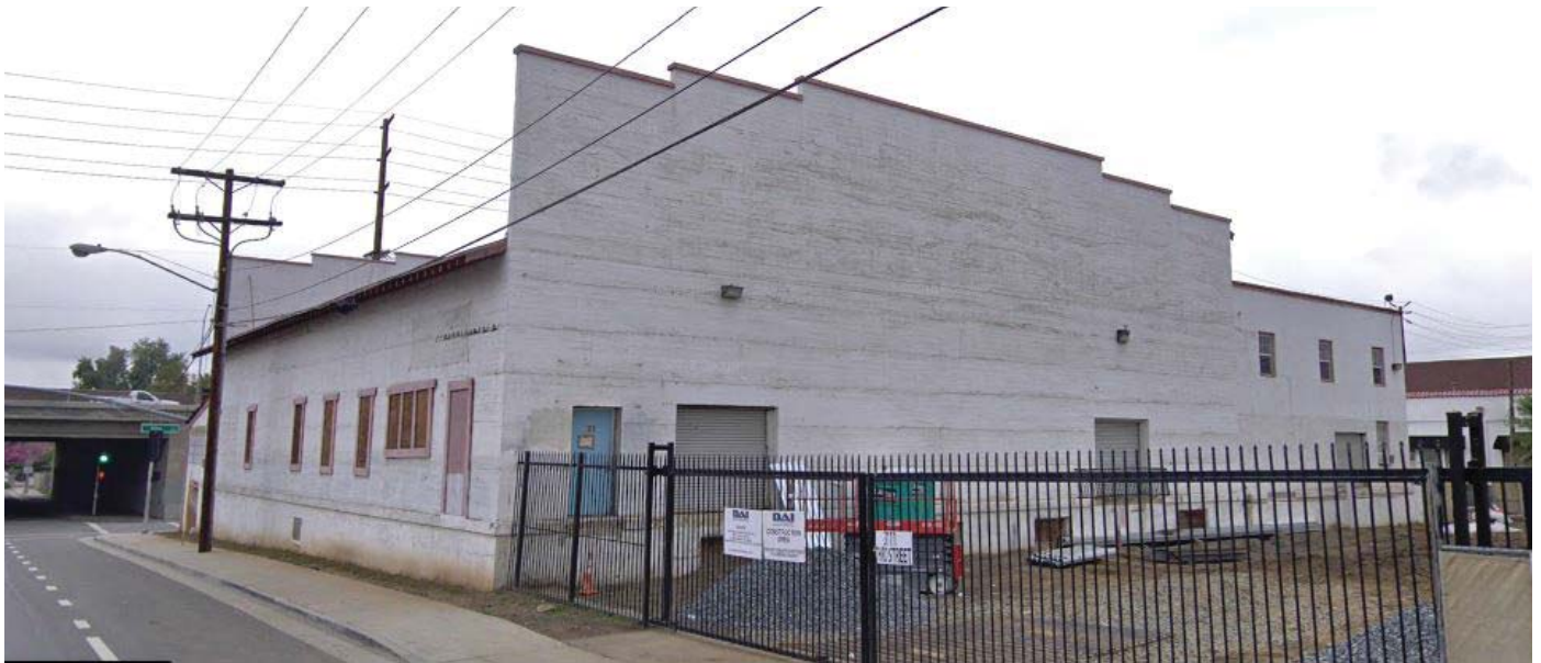
South and east elevations, view looking northwest