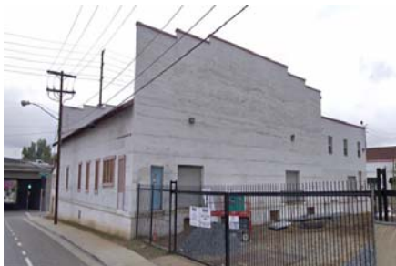
South and East elevations with example of Western False Front style stepped parapet and loading bays