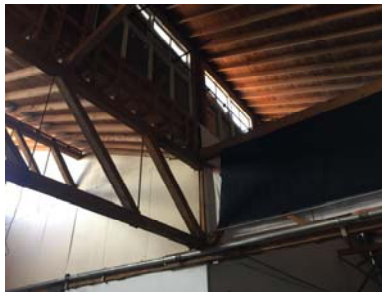
Saw-toothed roof with clerestory windows