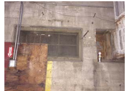
Basement ventilation windows