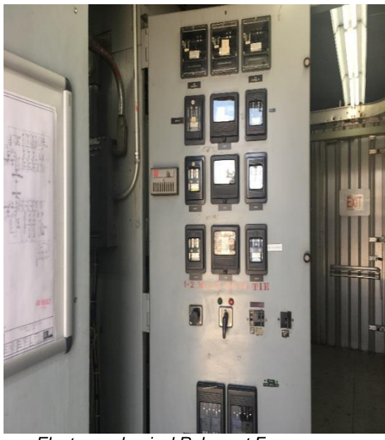
Electromechanical Relays at Freeman