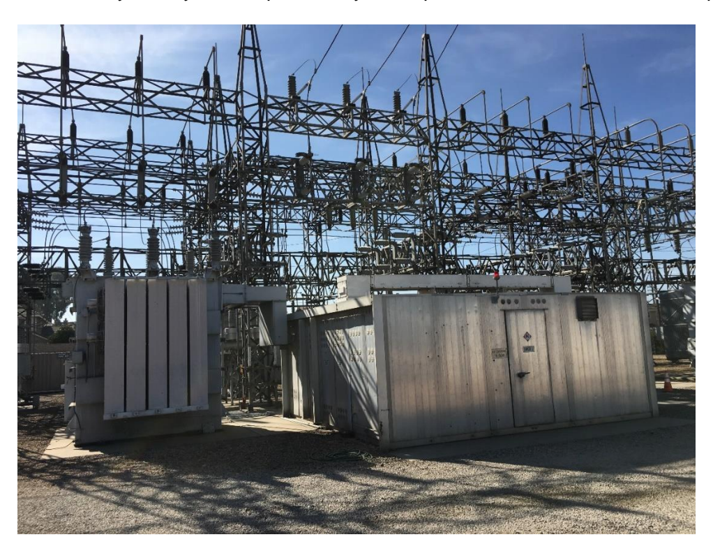
Freeman Switchgear 1 & 2 and Substation Power Transformer

Relays are also a critical component of electrical transmission and distribution systems. Electromechanical relays and control systems were the standard in the electrical industry until the 1980's. Since then, there has been a migration towards microprocessor-based relays and controls. RPU has standardized on the use of microprocessor-based relays for all new installations and upgrades. Electromechanical relays are prone to electrical and mechanical failures, require frequent maintenance, and have setting limitations compared to microprocessor-based relays, which perform the same protection operations, but with higher precision and reliability. Replacement of electromechanical relays with microprocessor-based relays is essential to increase safety and system dependability. See pictures below for substation equipment.