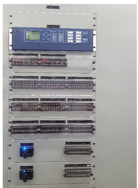
Typical Microprocessor Relays