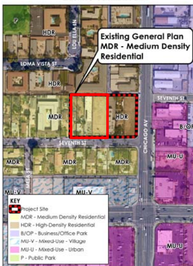
EXISTING GENERAL PLAN