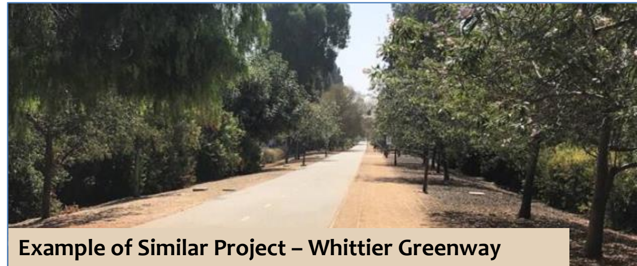
Example of Similar Project – Whittier Greenway