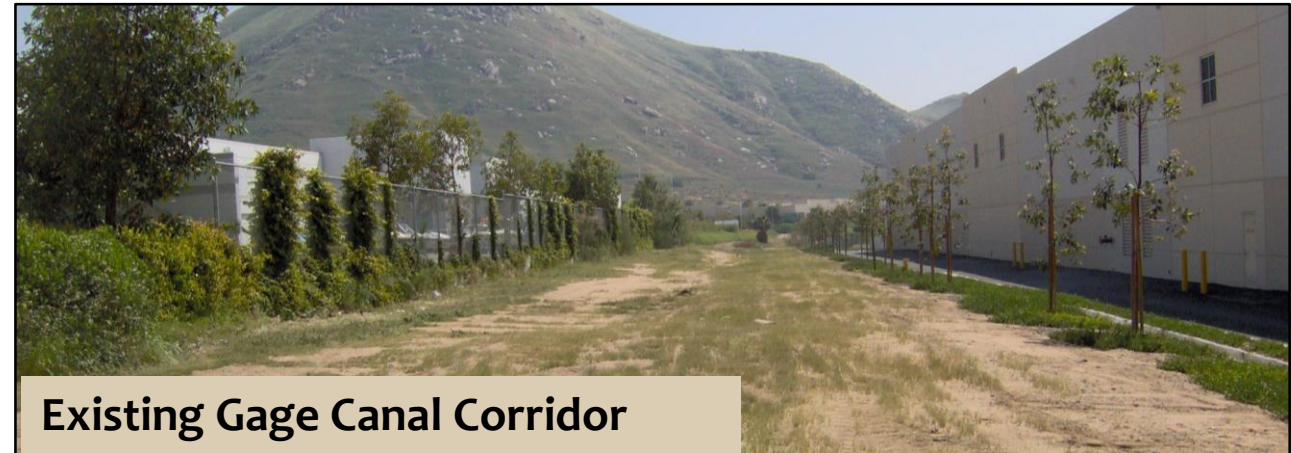
Existing Gage Canal Corridor