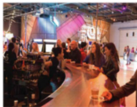
Craft Beer Only