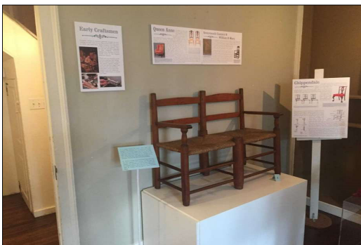
Historic Chairs Exhibit