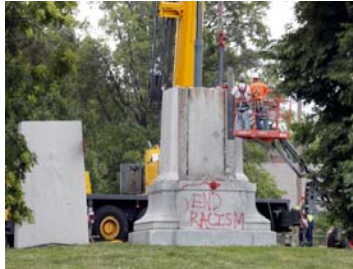
St. Louis Confederate Statue removal