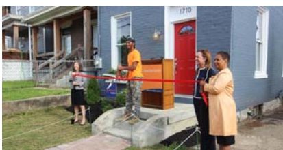
Hamilton County Land Bank