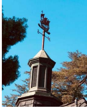
Nautical themed weathervane