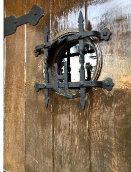
Sailing ship inspired porthole on door