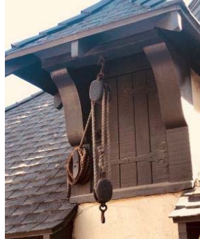
Faux hayloft reminiscent of the French farm houses