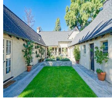
U-shaped central courtyard