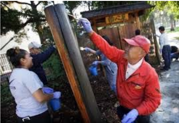
Orange Club volunteers cleaning garden