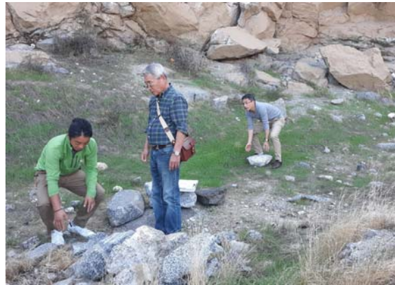
Master gardeners selecting rocks for the garden