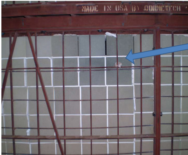
Example of SCR module with elements shifted and sealing materials missing