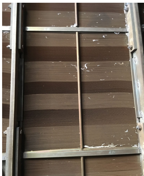
Example of CO Catalyst module