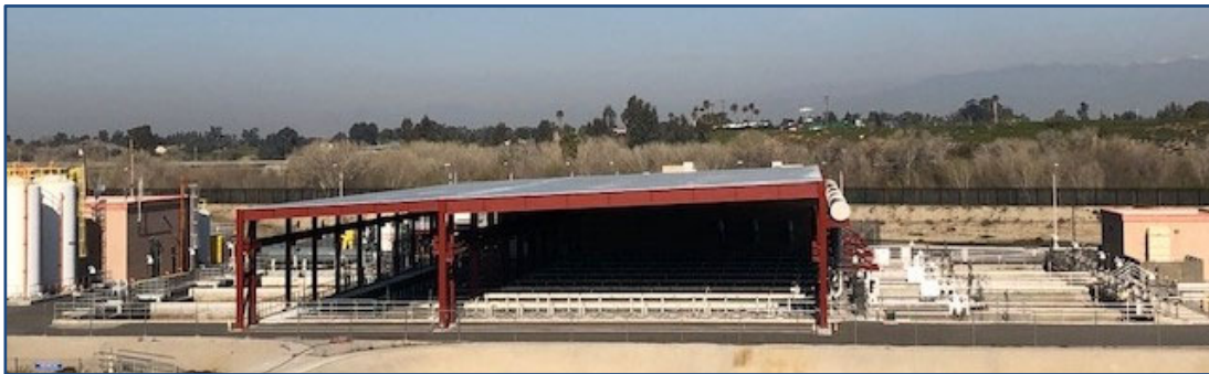
Membrane bioreactor system