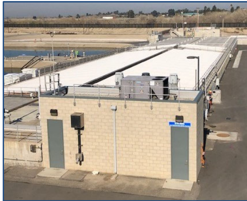
Disinfection system chlorine contact tank