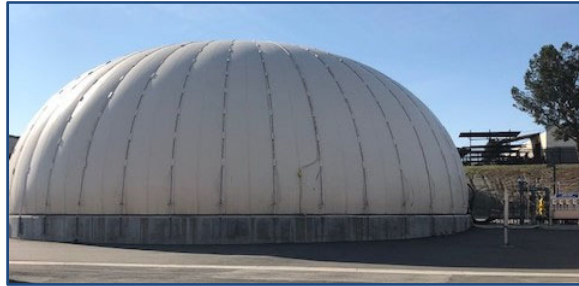
Bio-methane gas storage