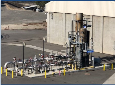
Bio-methane gas flare