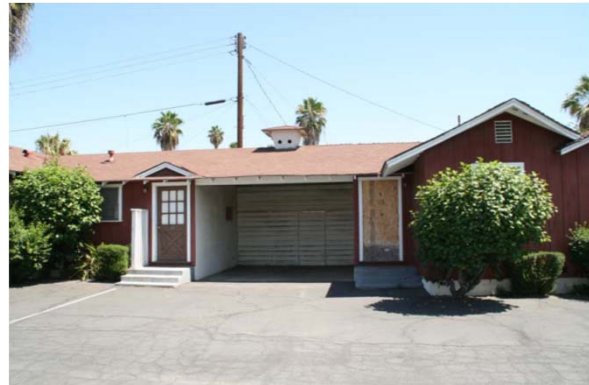
Example of integrated carport