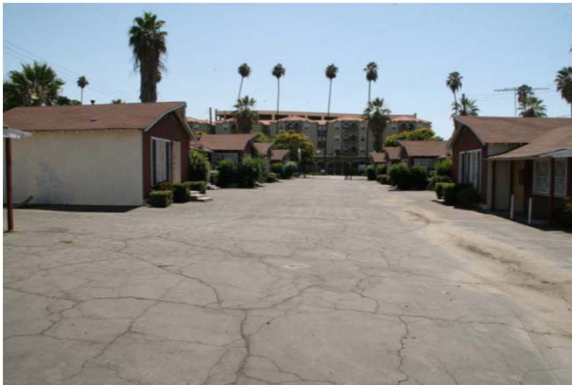
View of drive aisle look toward University Ave