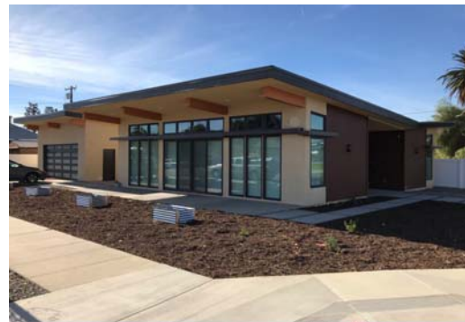
The Branch (Current)

The Branch not only promotes neighborhood art development and community engagement, but also provides an affordable rental opportunity for income-qualified "resident" artists.