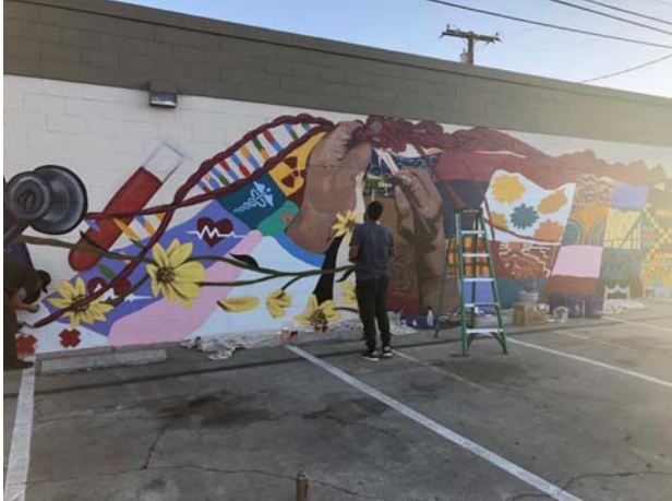
Eastside Health Center – 1970 University Ave.