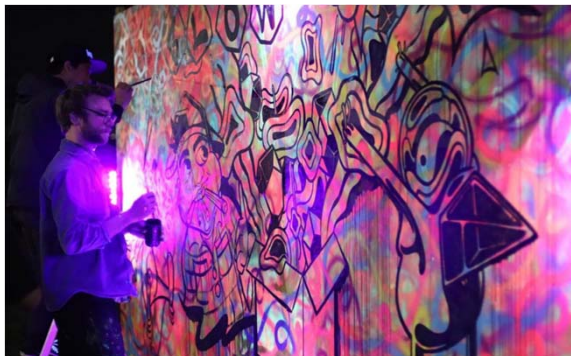
One of the public art displays at the Celebration.

This collaboration event between RCHF, Artist in Residence, community members, REAL, HEAL Zone & City of Riverside was a HUGE community success.