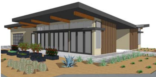
The Branch (Concept Drawing)

Riverside Art Museum's first artist-in-residence program, the "Branch" , was established in Eastside and is located at 4307 Park Avenue.