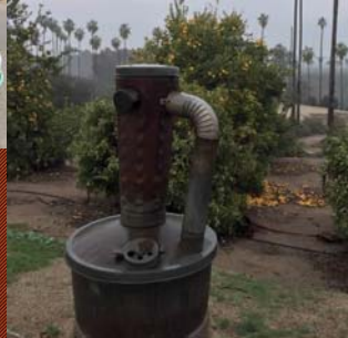
Citrus Heritage Run