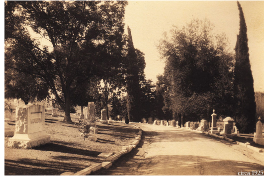
Olivewood Memorial Park, 1925