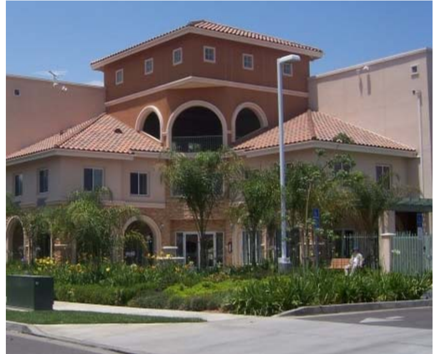
TELACU Las Fuentes