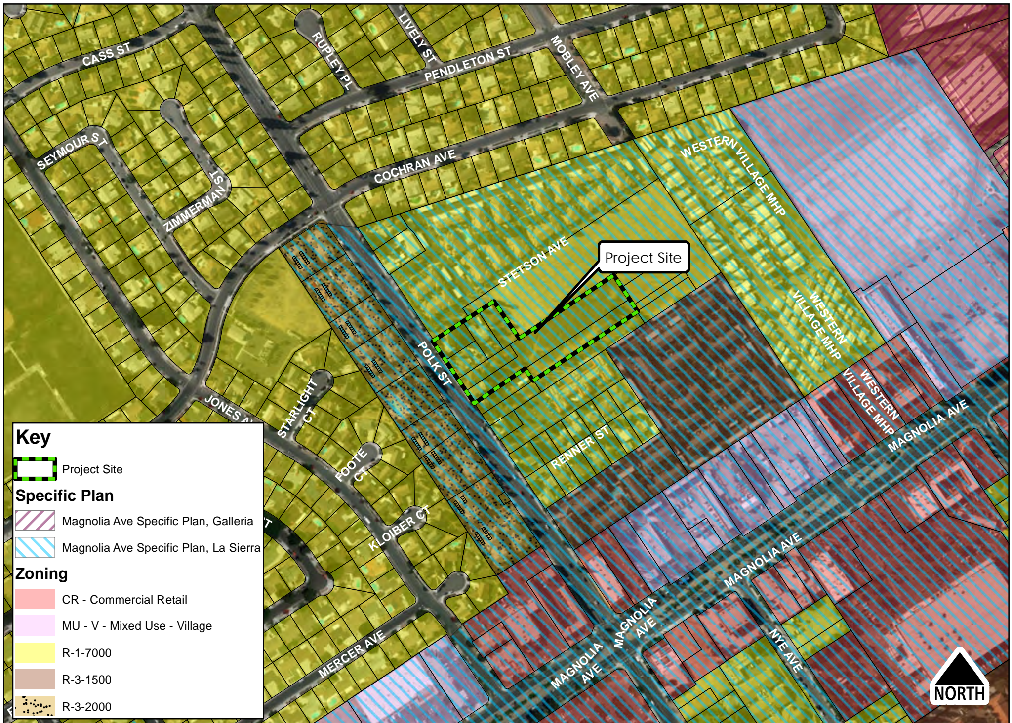
Exhibit 6 - Zoning and Specific Plan Map