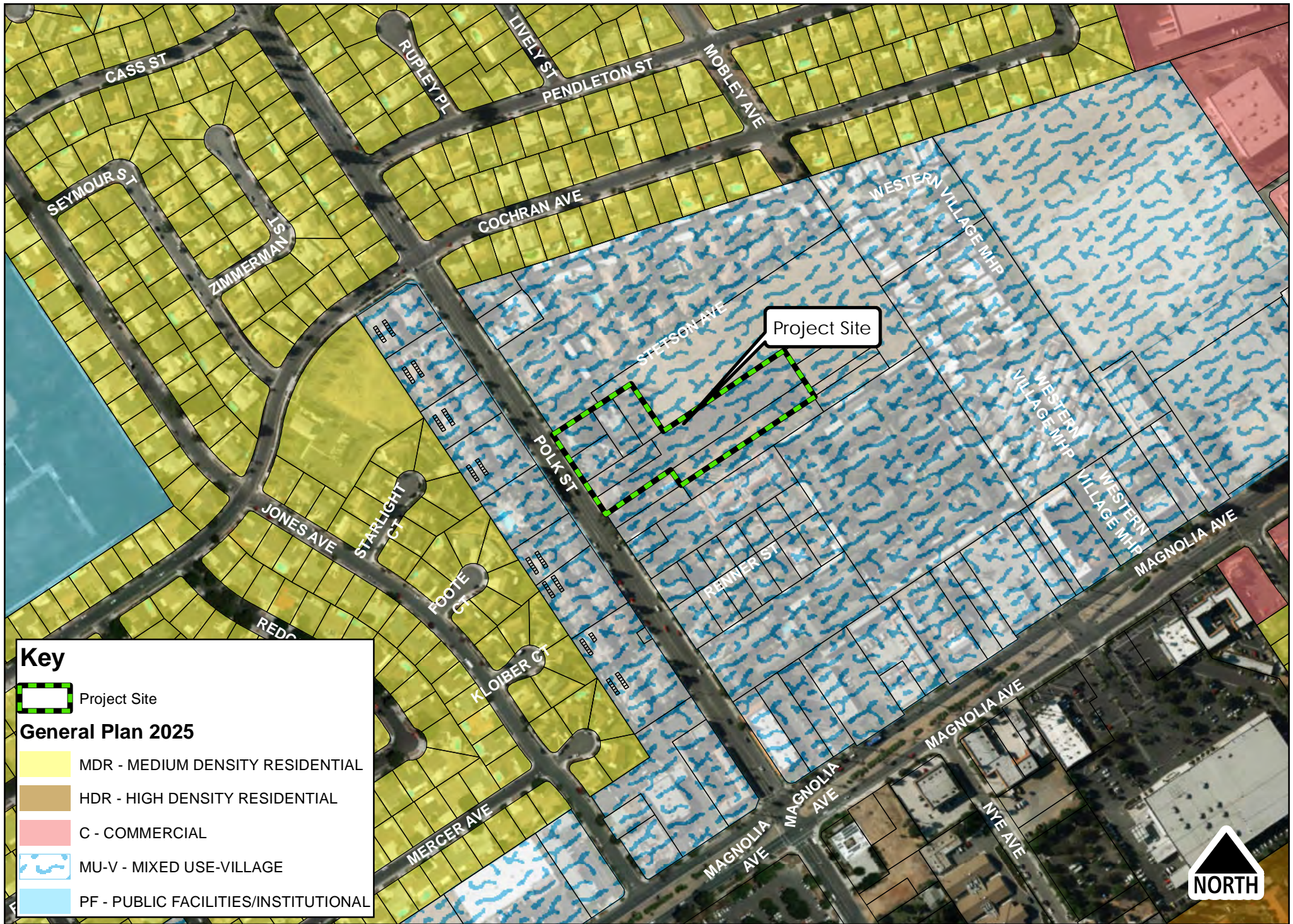
Exhibit 5 - General Plan Map