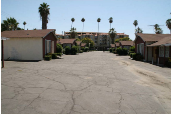
View of drive aisle looking toward University Ave