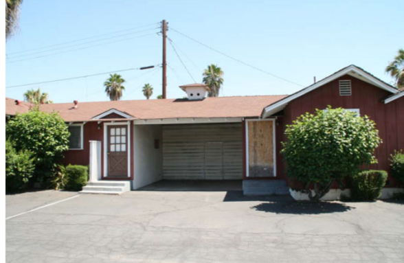
Example of integrated carport