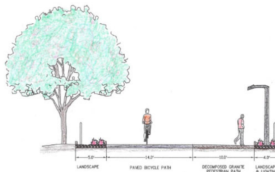
Cross section of Riverside Canal Trail

Riverside Canal Trail: The Riverside Canal Trail preserves the historic decommissioned Riverside Canal (underground) and provides an urban trail to connect residences, workplaces, commercial centers, active transportation (bus stop at Nash and Orange Street intersection), and a neighborhood school.