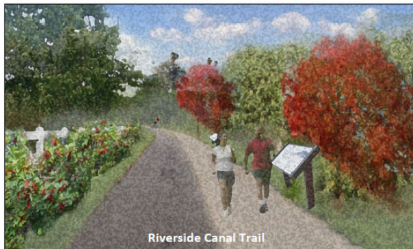
Riverside Canal Trail

Riverside Canal Trail: The Riverside Canal Trail preserves the historic decommissioned Riverside Canal (underground) and provides an urban trail to connect residences, workplaces, commercial centers, active transportation (bus stop at Nash and Orange Street intersection), and a neighborhood school.