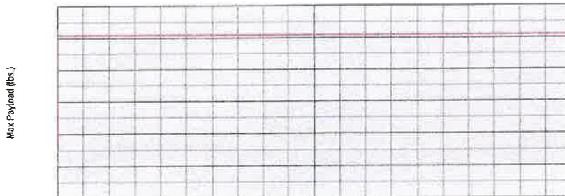
Ryan Chart ®