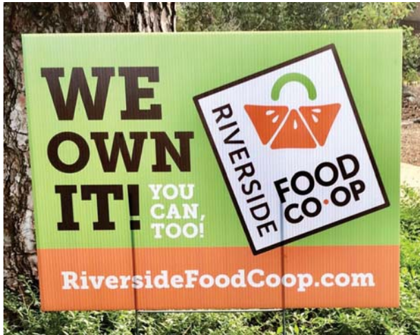
Riverside Food Co-op Purchases from local growers.