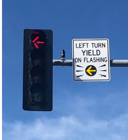
PHOTO OF PILOT PROJECT IMPROVEMENTS