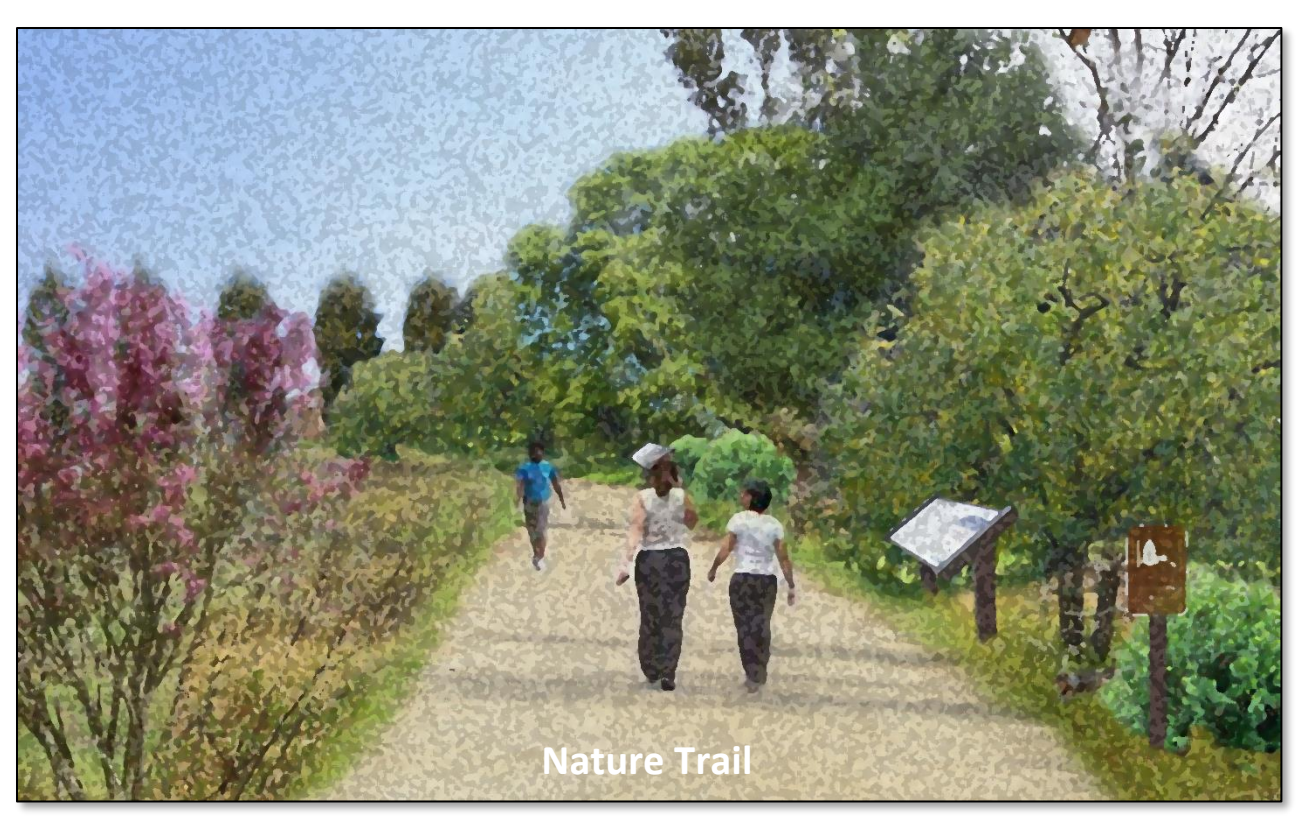
Nature Trail: The interpretive Nature Trail expands open space and creates opportunities to learn. This trail includes native trees and vegetation selected to provide habitat for wildlife and birds.