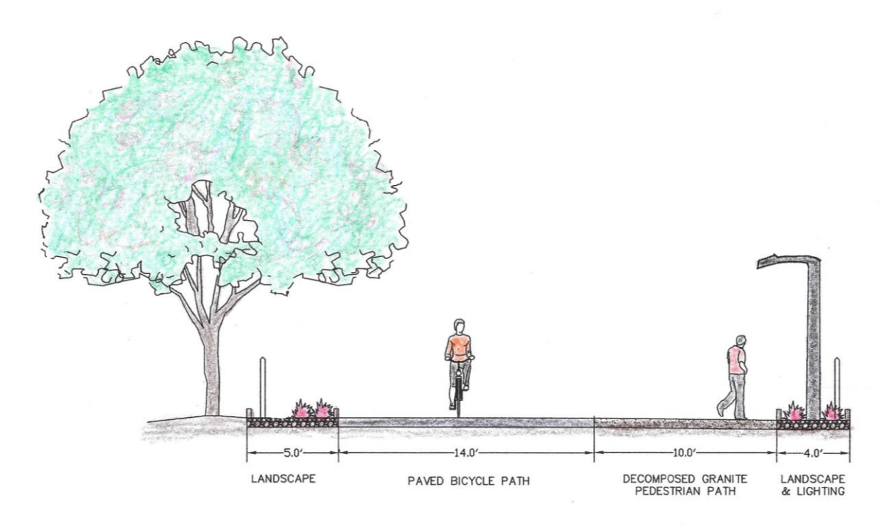
Cross section of Riverside Canal Trail