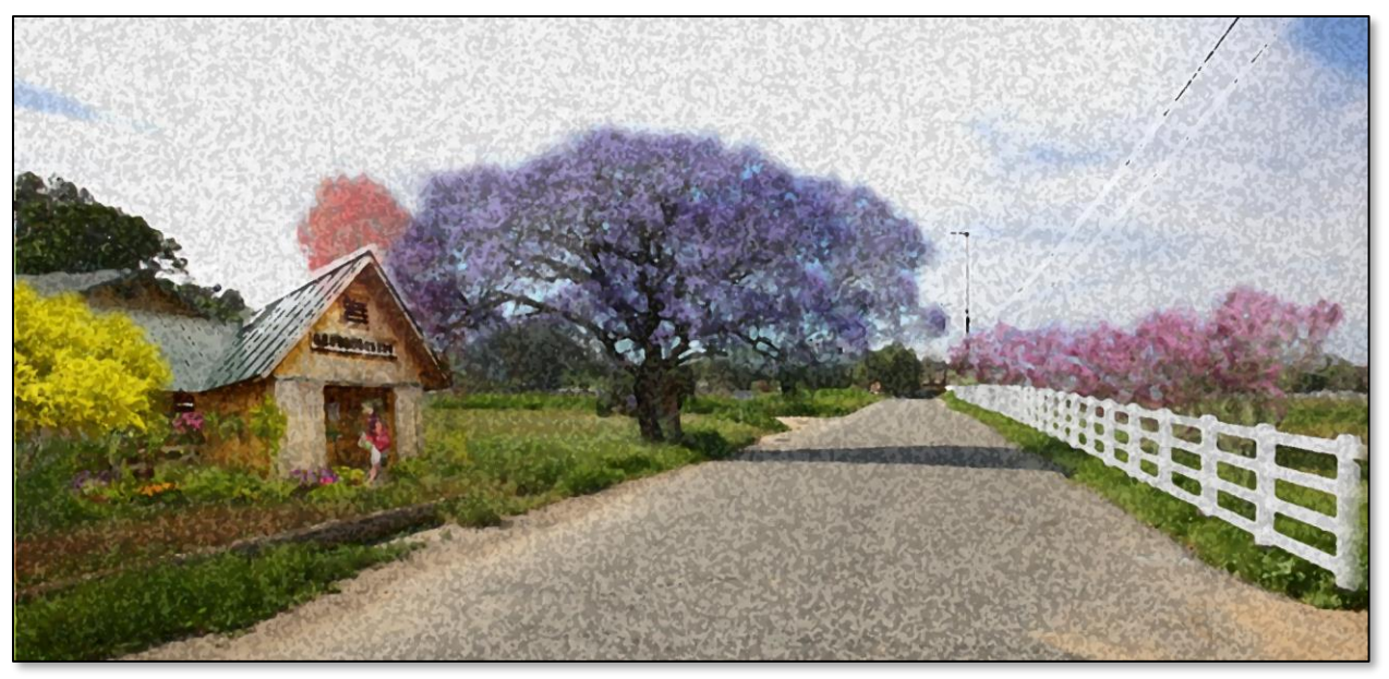
Clark Street: Shade trees will be planted along Clark Street. Existing structure will be renovated with matching funds into a Co-work Learning Center on 900 Clark Street (left side of picture). The center will provide community spaces for area nonprofits, provide shared office space for local micro-entrepreneurs, and host a produce stand to increase access to fresh produce in the Northside food desert.

Northside Community Garden & Pavilion: The Northside community garden and outside pavilion will provide 24 community garden plots with handicap accessible raised beds. A canvas-covered pavilion provides community space for workshops, community gathering events, and a host site for a certified farmers' market for the Northside neighborhood. Shade trees will surround the Co-work Learning Center (pictured in the right).