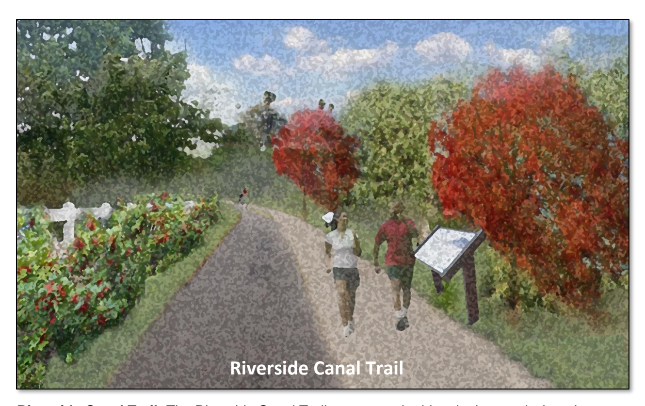
Riverside Canal Trail: The Riverside Canal Trail preserves the historic decommissioned Riverside Canal (underground) and provides an urban trail to connect residences, workplaces, commercial centers, active transportation (bus stop at Nash and Orange Street intersection), and a neighborhood school.