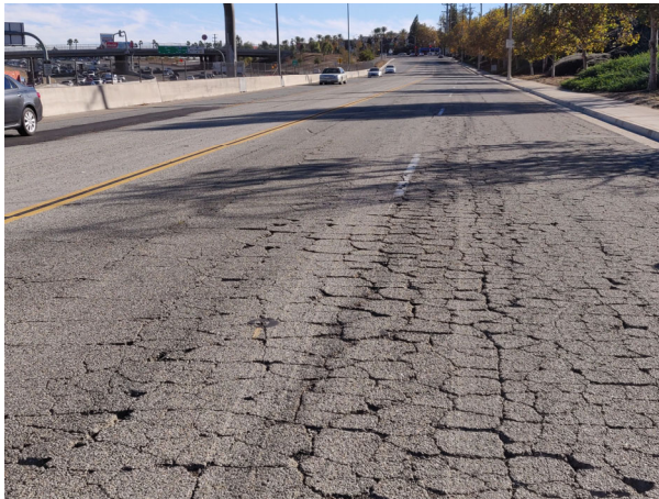
SYCAMORE CANYON BOULEVARD