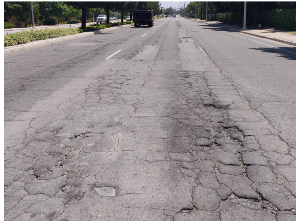
VAN BUREN BOULEVARD