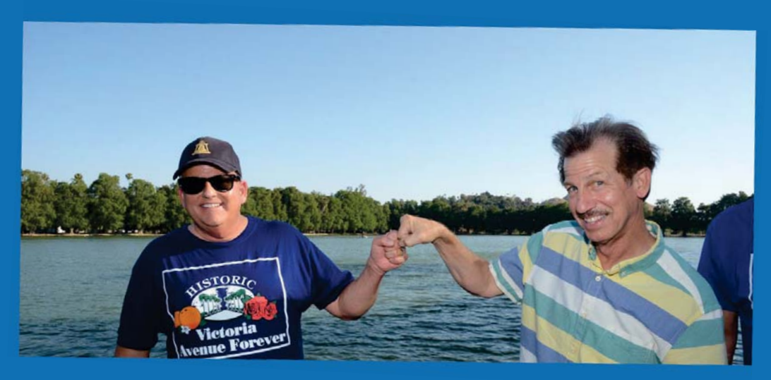
Good Sports, Good Show!

Thanks to Chick fil-A Nothing Bundt Cakes for their donations of marvelous food