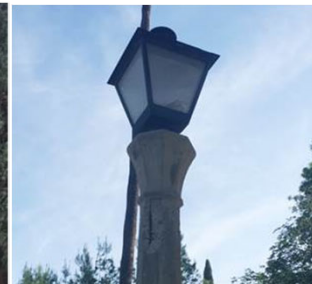
TOWN &amp; COUNTRY TOP