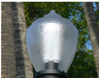
NEW ACORN TOP WITH LED LAMP