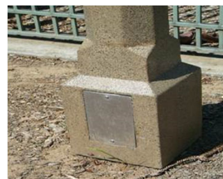
NEW KODIAK STANDARD