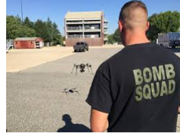
Technical Services Unit