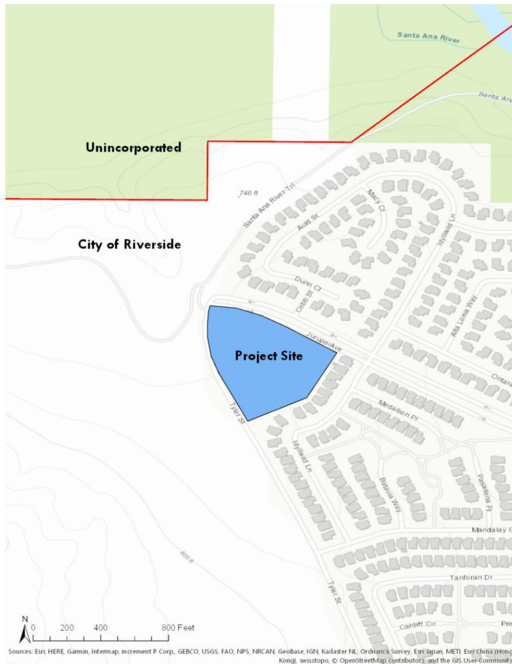
Figure 2, Local Vicinity