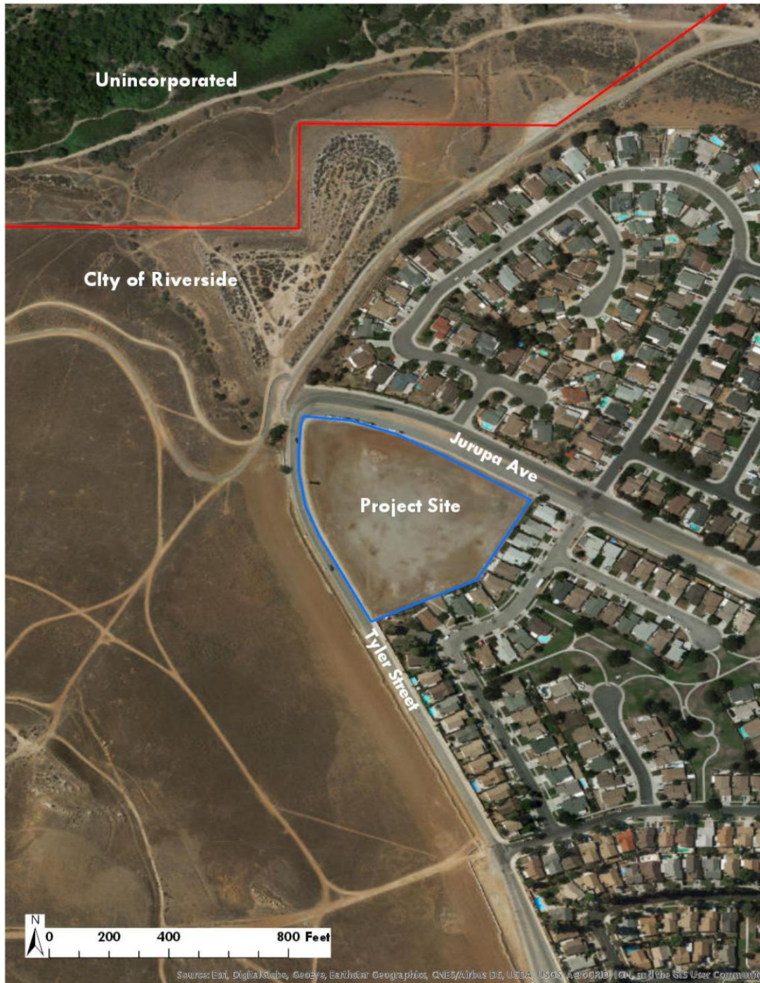
Figure 3, Aerial Photograph