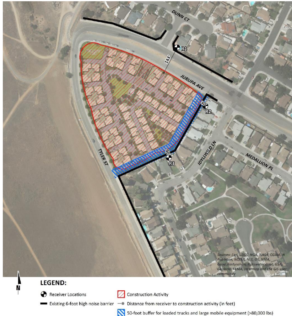
Figure NOI-1: Construction Vehicle Restrictions