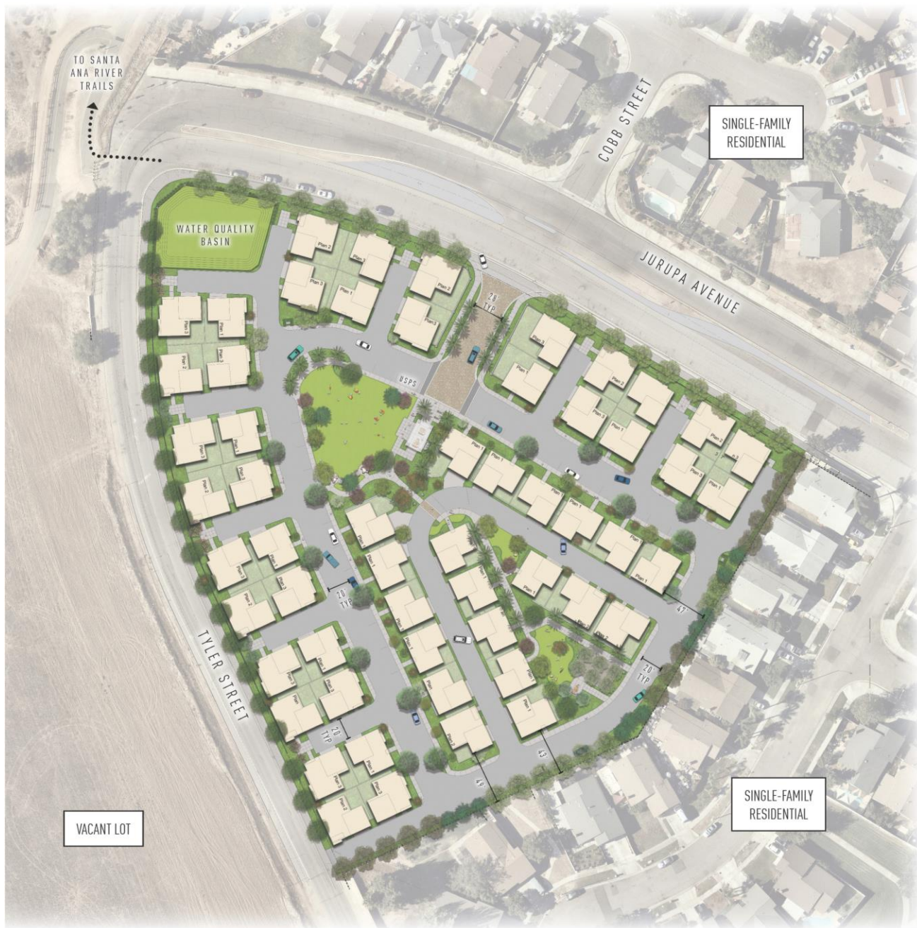
Figure 4, Conceptual Site Plan