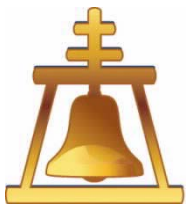
EXHIBIT 2 – STAFF RECOMMENDED CONDITIONS OF APPROVAL