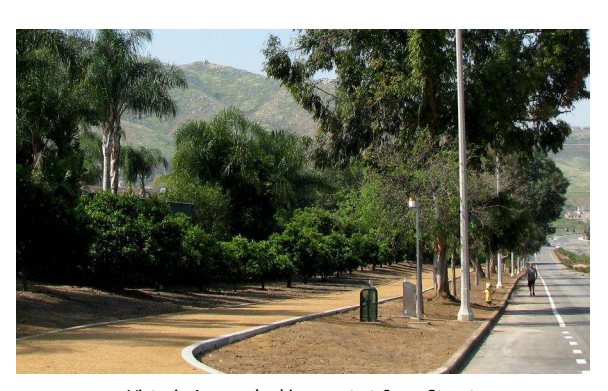
Victoria Avenue looking west at Cross Street